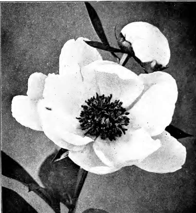
La Fiancee, Superb Single Peony Blooms early, but side buds keep it in bloom until late

Single. Those with a single row of wide guards, and a center of yellow pollen-bearing stamens. Semi-Double. Those with several rows of wide petals, and a center of stamens and partially transformed petaloids.